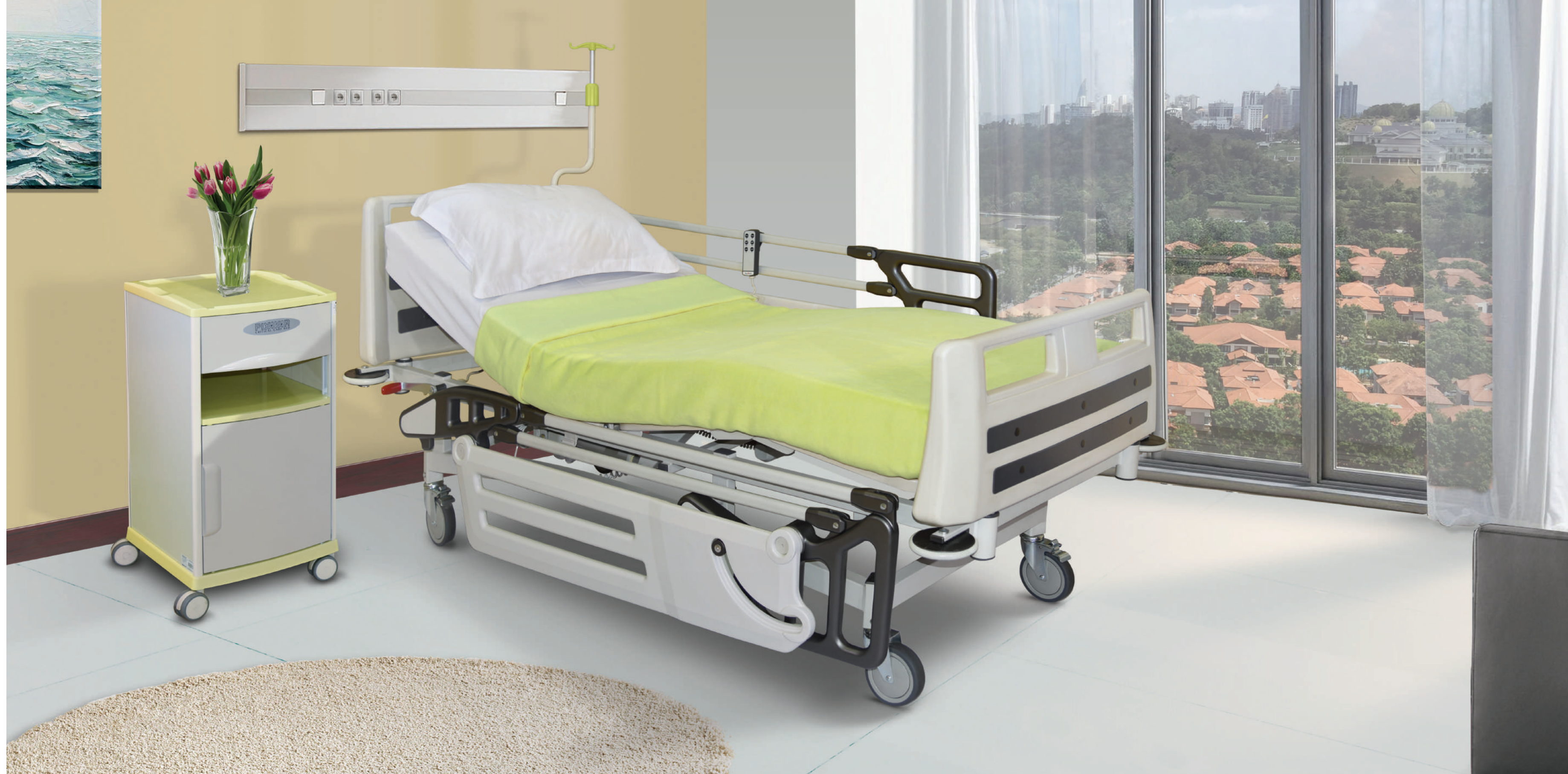
General Bed 25000 EC1